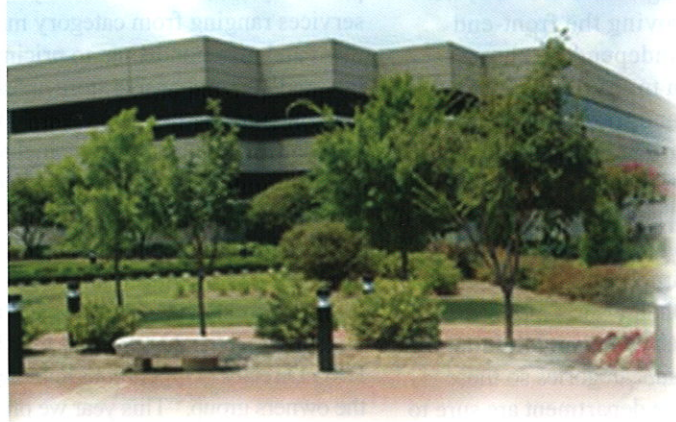
J M Smith Corporation headquarters in Spartanburg, S.C.

In Association with the South Carolina Chamber of Commerce, The 29th Annual Ranking of the State's Largest Privately Owned Companies.